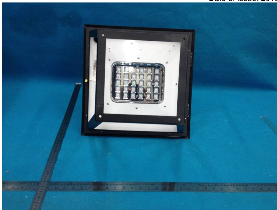
Model: T-75MNLED MODEL